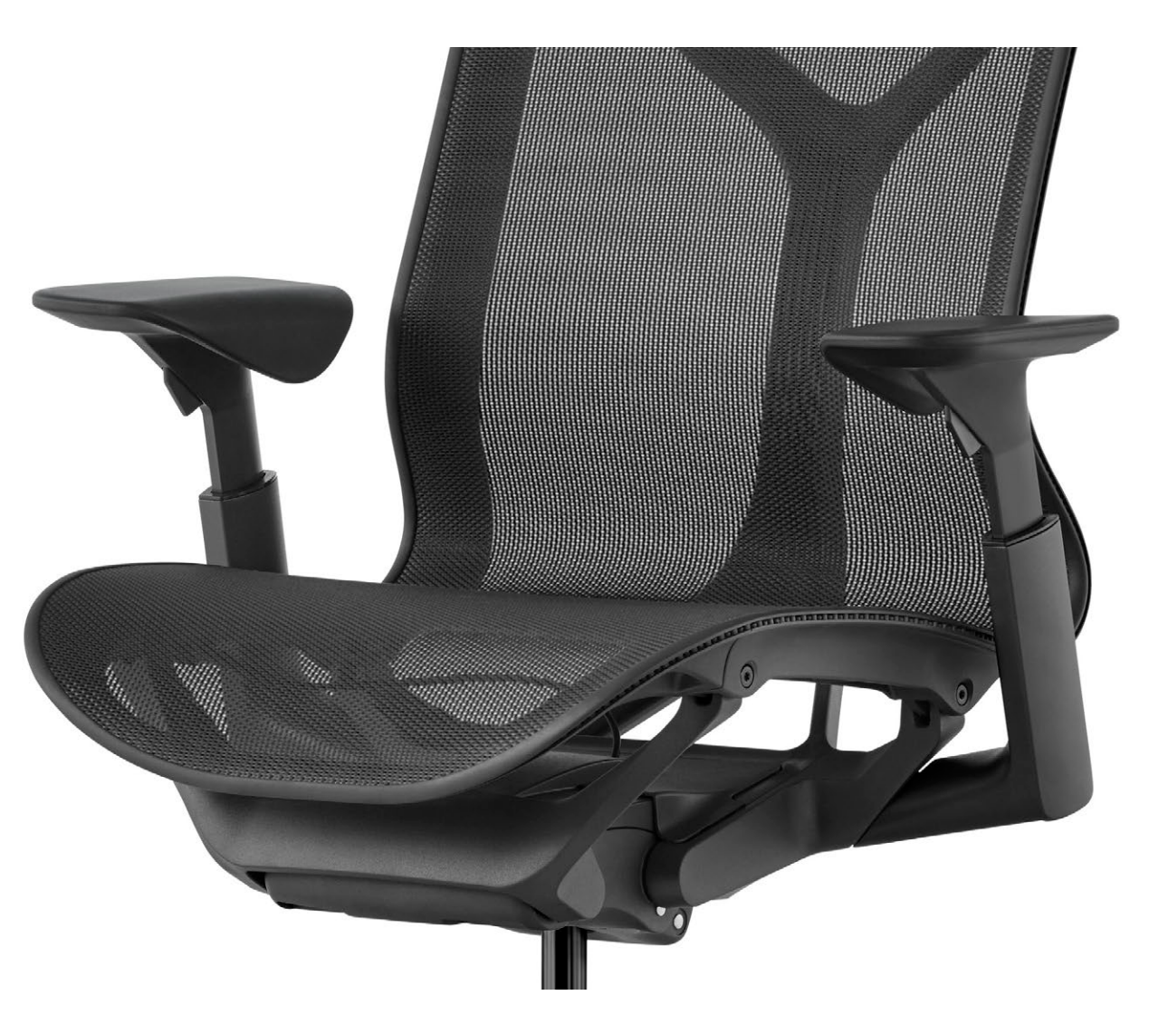
"You should have a chair that allows you to change postures as easily as possible," the designers say. "You can only do that with a chair that is correctly adjusted, so we wanted to build a chair that does that part for you."