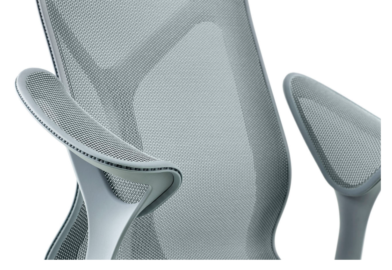
Cosm's innovative new Leaf Arms—the first of their kind—feature a soft but firm cradle design that provides a large, cozy resting place for your elbows. The arm rests make holding a phone or book natural and comfortable, and the angle of the arms mean they don't get in the way of a work surface when it's time to get back online.