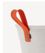
Traffic Orange RAL 2009