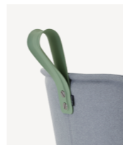
Pale Green RAL 6021