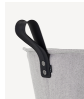
Black Grey RAL 7021