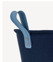
Pastel Blue RAL 5024