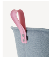
Light Pink RAL 3015