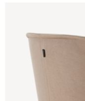
Without Strap Handle

The cold cure foam material has been tested to meet the following standards: