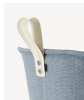
Oyster RAL 1013